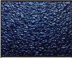
TUFF Skin Surface

This amazing flooring product can be fabricated to any shape or size. Please submit drawing with dimensions and beveling specifications to your local Rep. for a quote.