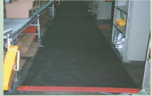
Ortho I Molded Material with Antimicrobial