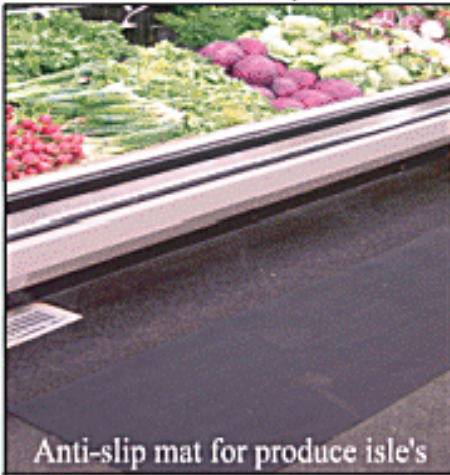
Anti-slip mat for produce isle's