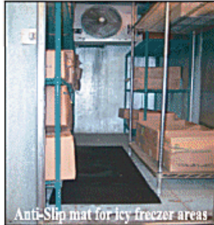
Anti-Slip mat for icy freezer areas